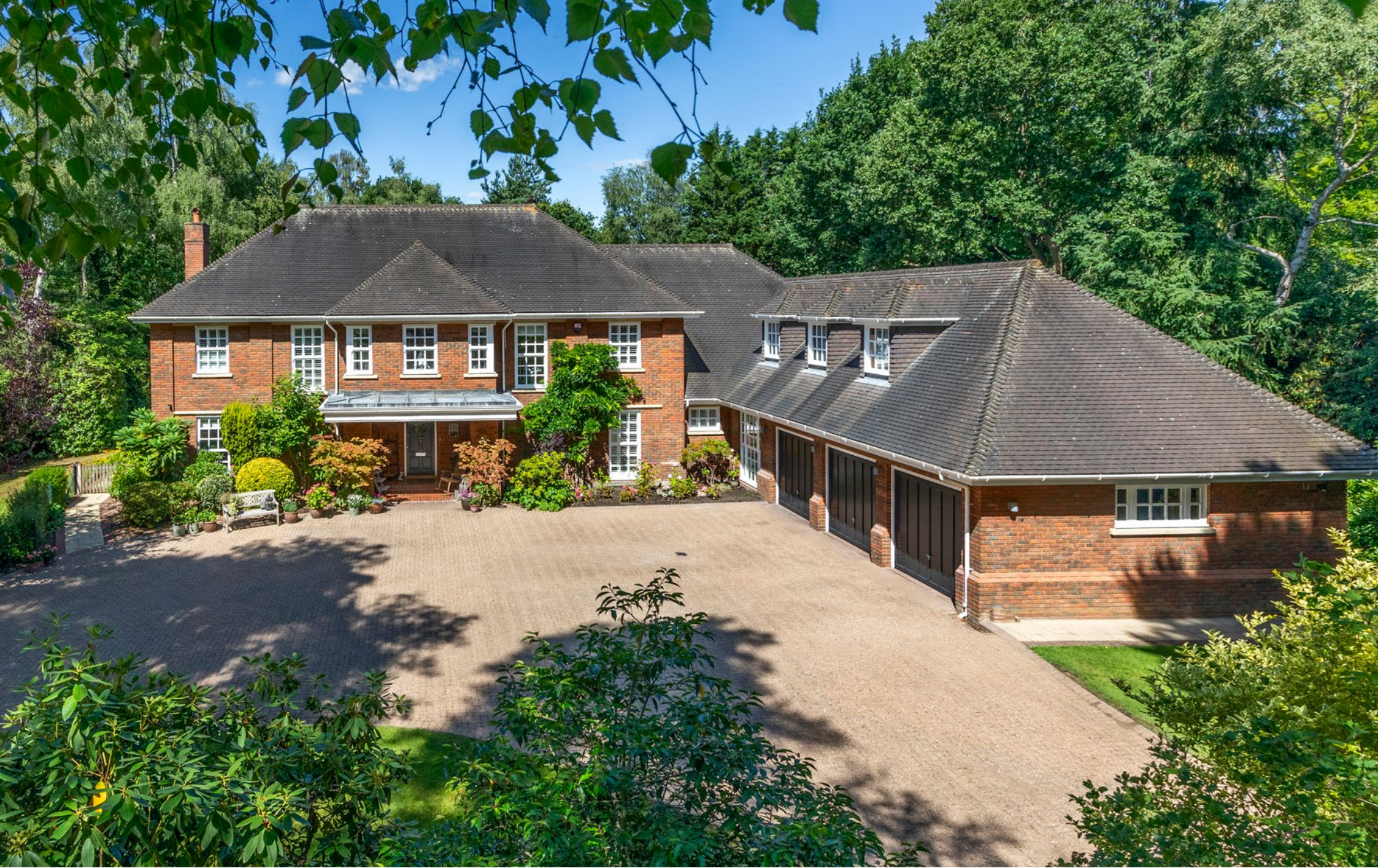
ATTEN HOUSE WENTWORTH