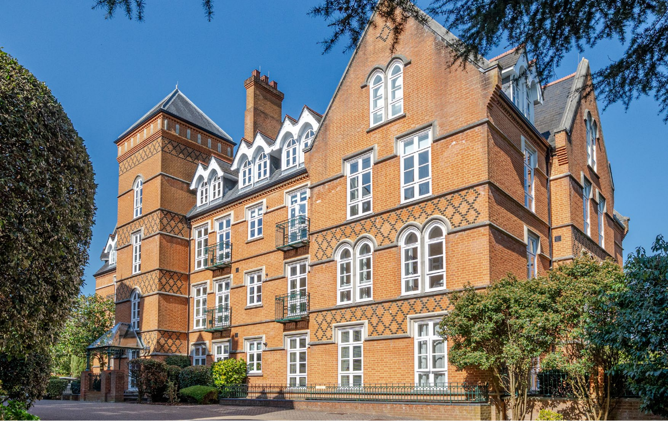
20 GILLESPIE HOUSE VIRGINIA WATER